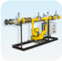
Gas pressure booster